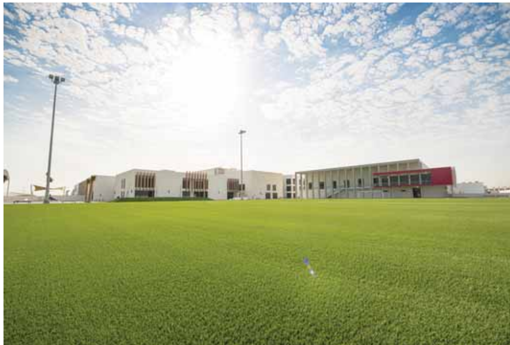
Spanning 60,000 sqm, the new campus is designed to accommodate almost 2,500 students and has facilities designed for inside and outside-the-classroom learning.