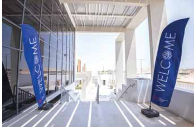
The indoor and outdoor facilities at the new campus offer extensive academic and extra-curricular choices and deliver the ACS trademarked standard of education.